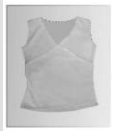
Girls Cross Top