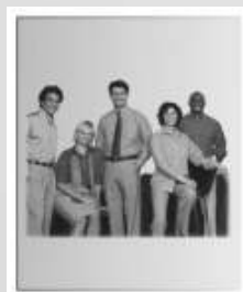
Management Staff Wear