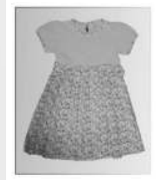
Girls Top Skirt