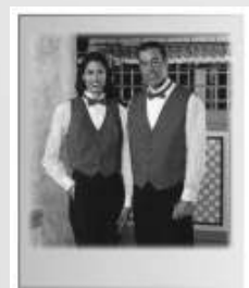
Hotel Industry Aprons