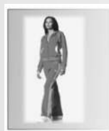
Fitness & Yogawear