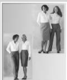
Ladies Staff Wear