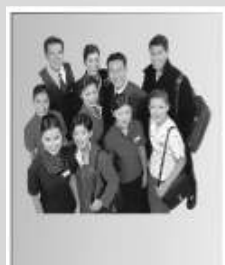
Airline Staff Wear