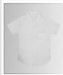
Snap Button Shirt