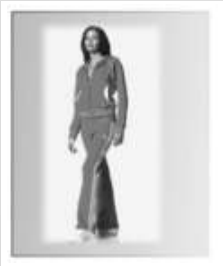
Fitness & Yogawear